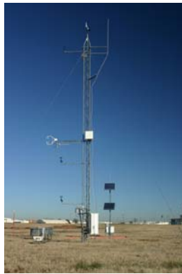
NRMN, Oklahoma Mesonet