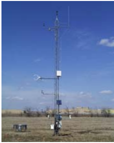
NORM, Oklahoma Mesonet